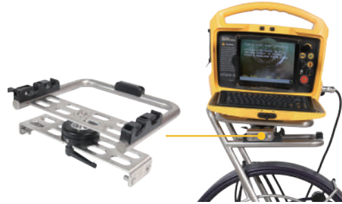
Rotate and Tilt Mounting Table